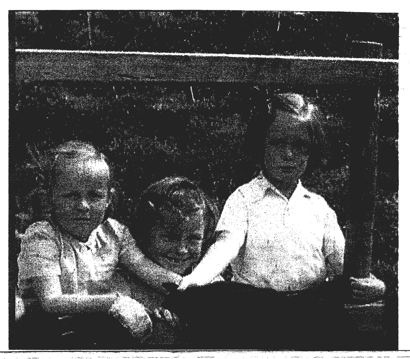
Rutland Railway Museum

The MoD are to establish a temporary museum site in St.James's Park in central London as part of the national commemorations to mark the 60th anniversary of the end of WW2. The museum will be open to the public between 4th-10th July 2005.